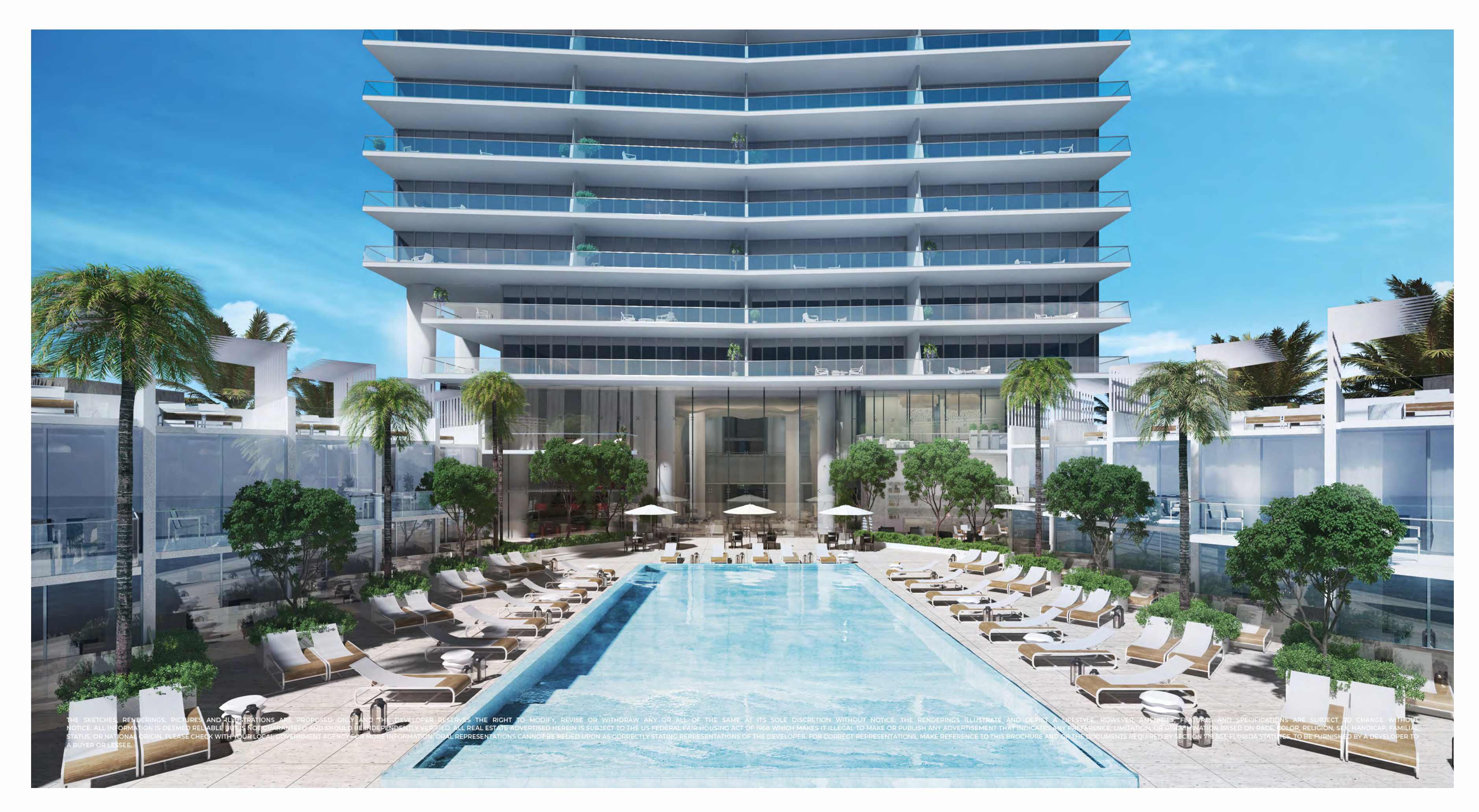
Becoming a Turnberry Ocean Club owner also has additional privileges through The Turnberry Isles Country Club, Fontainebleau Aviation & Turnberry Isles Marina (Marina & Tennis).